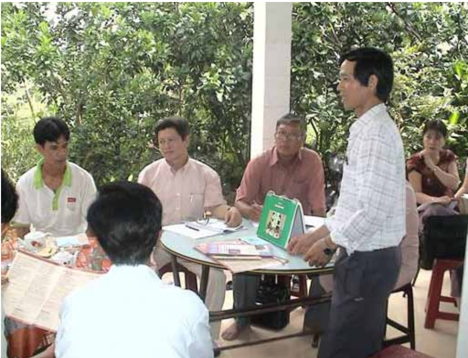
Discussion on DVPC at a residential meeting in Binh Dai district, Ben Tre province