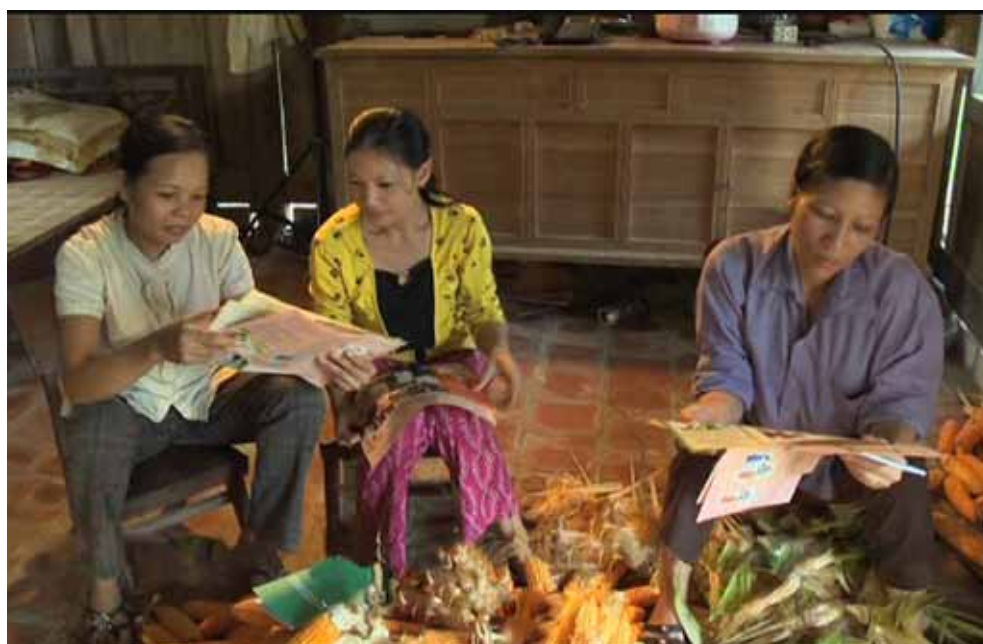
DV information provided to the community

Policy-makers need successful and evidence-based models of programming in order to make adequate policy, strategy, programme and budgetary decisions with regard to the development and provision of services for survivors of GBV/DV. These lessons learned provide a strategic direction on GBV/DV response in Viet Nam, including information that will help them in developing an intervention model that suits the needs of the Vietnamese society, culture and political and administrative structures.